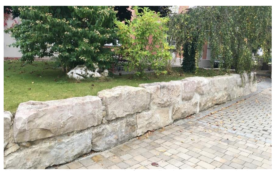
Natural stone walls -- one example for application among many in the new overall brochure "Natural talents - the PCI Carra line" (Link to high-resolution Photo)