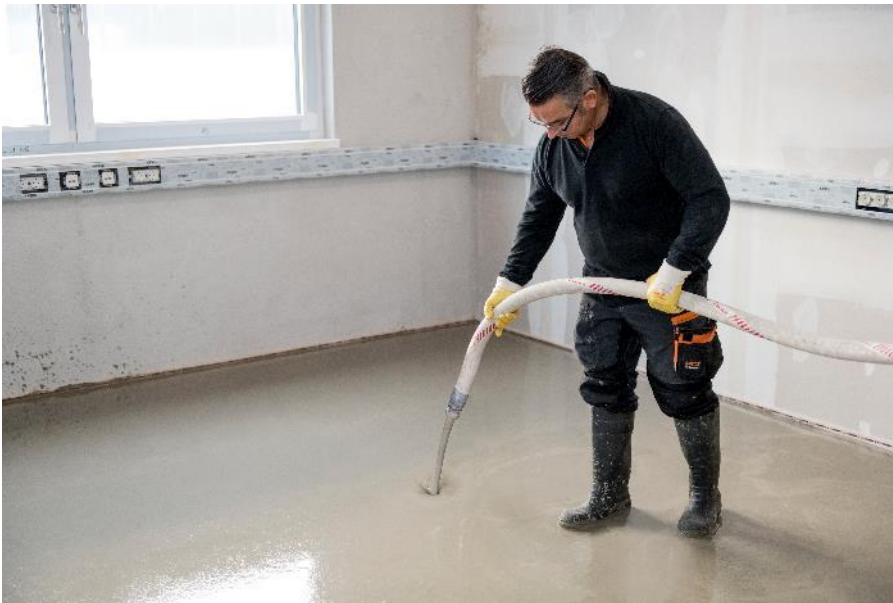
PCI Novoment Flow: now even easier to pump ( Link to high-resolution photo )